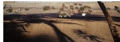
Mathieu Briand, Et In Libertalia Ego, vol. II.