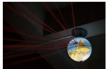
Mathieu Briand, Et In Libertalia Ego , vol. II.

Briand's project is called Et In Libertalia Ego and entering the exhibition's magical spaces is like embarking on a sort of enchantment. In many ways, it has the quality of a children's adventure story – tall ships, caves, secret huts, mystical trees and beaches. There is a golden glow about it, as if it were buried treasure (which it is, deep in the recesses of MONA). Afterwards, visitors might feel like they have been to Briand's distant island.